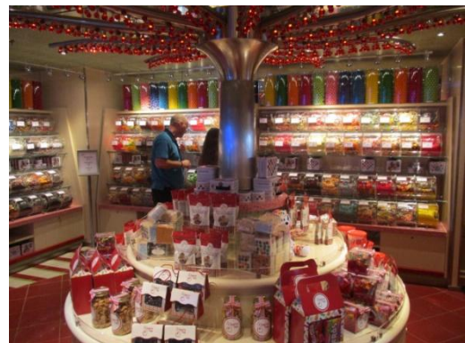
Cherry on top