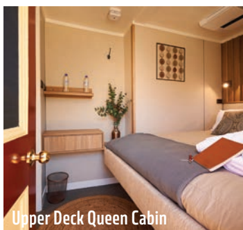
Upper Deck Queen Cabin