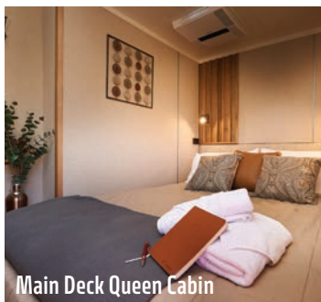
Main Deck Queen Cabin