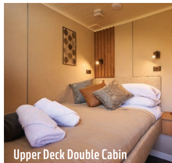
Upper Deck Double Cabin