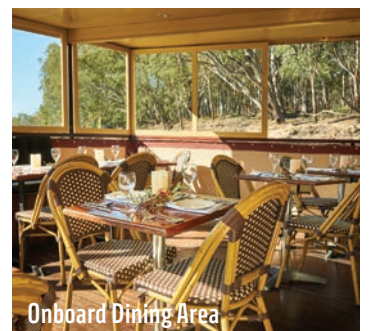
Onboard Dining Area

* All cruises are subject to terms and conditions - refer to passenger cruise agreement. Prices valid 1st April 2021 through to 31st December 2022.