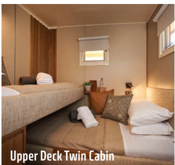
Upper Deck Twin Cabin