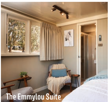
The Emmylou Suite

DEPARTS SELECTED MONDAYS AT 2.30PM. RETURNS SUNDAY AT 9.30AM. FROM AUD $3,350pp