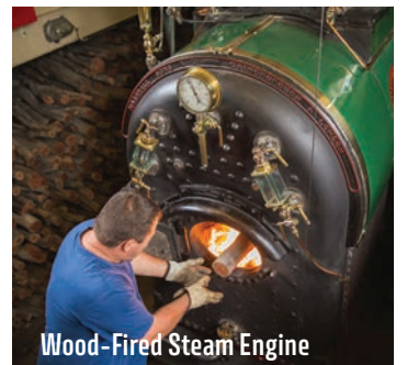
Wood-Fired Steam Engine