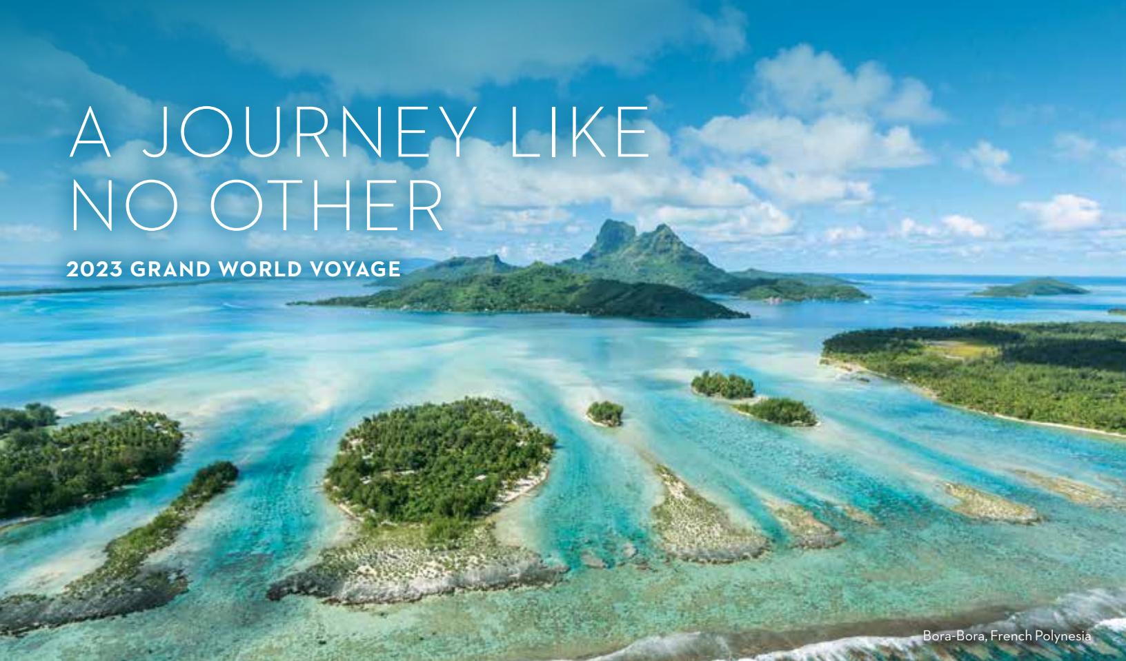
Bora-Bora, French Polynesia