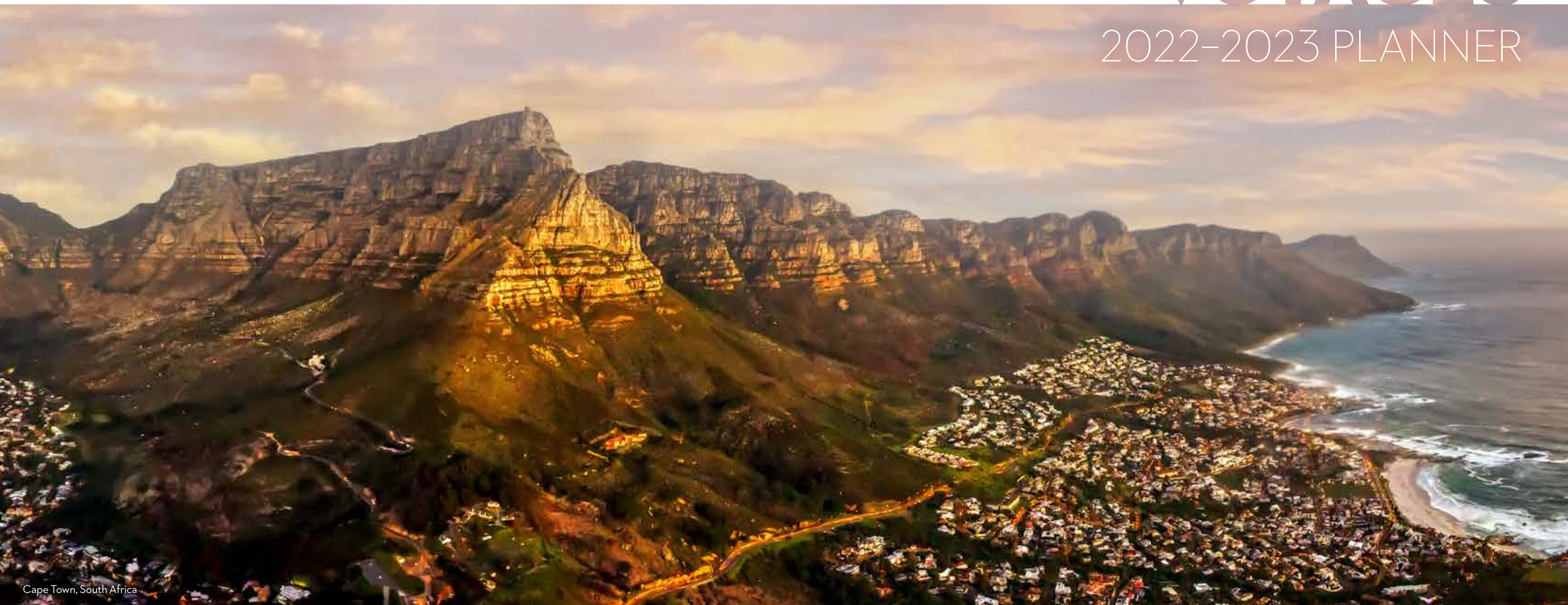
Cape Town, South Africa