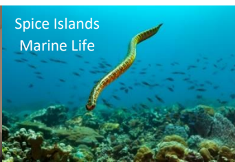
Spice Islands Marine Life