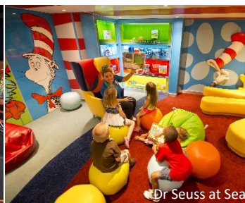
Dr Seuss at Sea