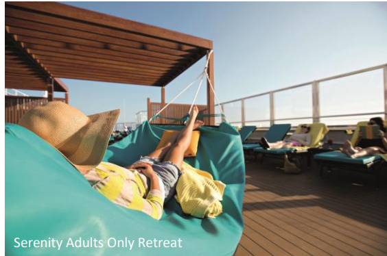
Serenity Adults Only Retreat