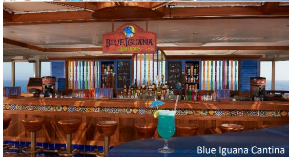
Blue Iguana Cantina