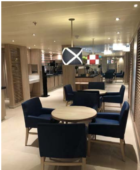
Family Harbour Lounge

Family Harbour Suite (Cabin 2412) which comes with the Family Harbour Lounge: