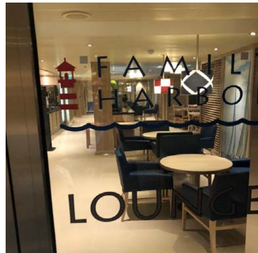
Family Harbour Lounge