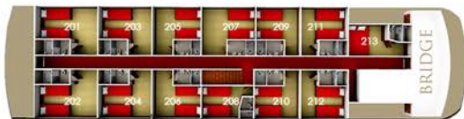
RICHARD HANNAY DECK