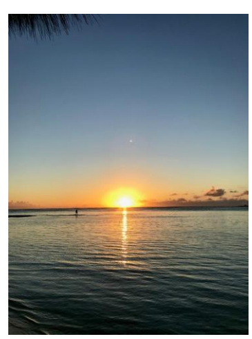
back to the ship.

In the afternoon after some lunch we relaxed by the pool, had some cocktails and got ready for a departure from the ship to take us to a private Motu in the evening. There were three catamarans that went to the little private island and