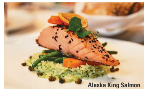
Alaska King Salmon