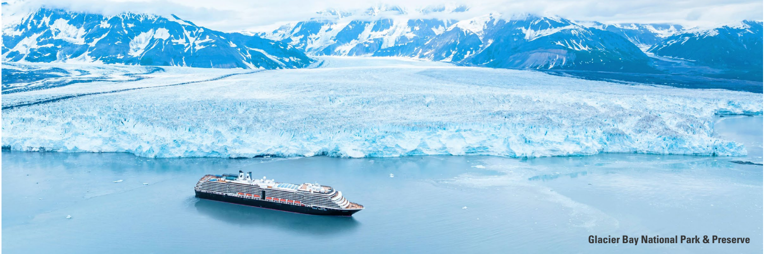
Glacier Bay National Park & Preserve

SEE MORE ALASKA GLACIERS WITH US THAN ANY OTHER CRUISE LINE