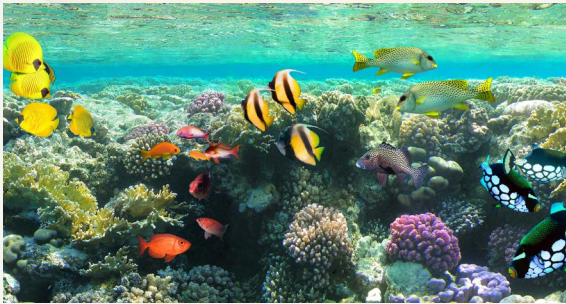
Uncover an underwater world