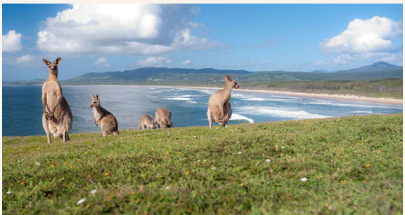
Kick back on Kangaroo Island