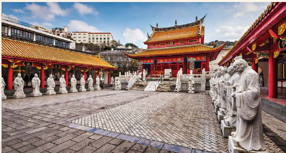
Koshibyō Shrine, Nagasaki, Japan