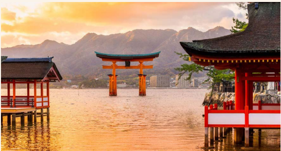
Miyajima torii gate, Hiroshima, Japan