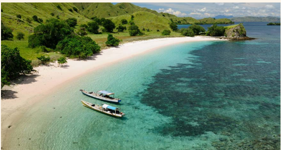
Marvel at Komodo Island's fierce reptiles