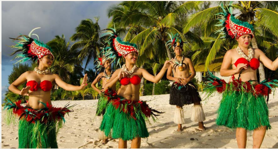
Immerse yourself in island traditions