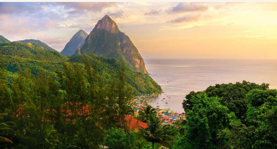
Marvel at St. Lucia's towering Pitons

Sail open seas and a storied river on this spectacular voyage from the Caribbean Islands to the Amazon rain forest and back.