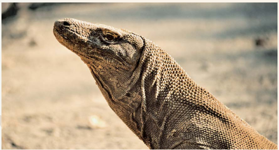
Meet Earth's largest lizards