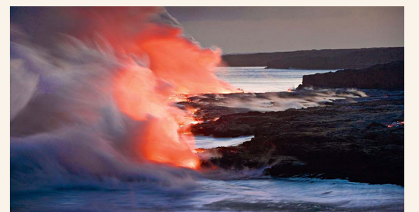
Discover Hawaii's fiery islands