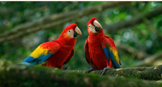
Delight in Amazonian wildlife