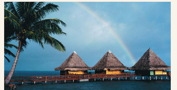
Bask in beautiful Moorea