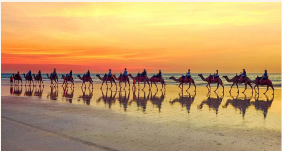
Enjoy a sunset camel ride in Broome