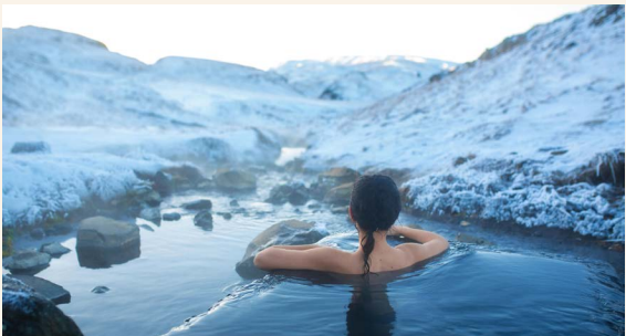
Immerse yourself in Iceland's majestic fjords