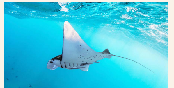
Swim with friendly stingrays