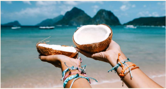
Sample a taste of local fruit