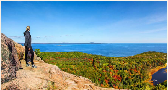
Take in coastal Canadian views