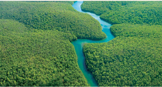
Sail the storied Amazon River