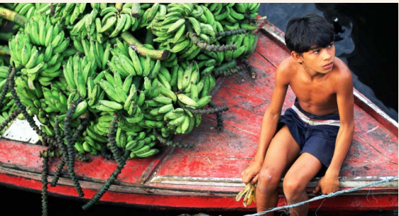
Encounter friendly locals