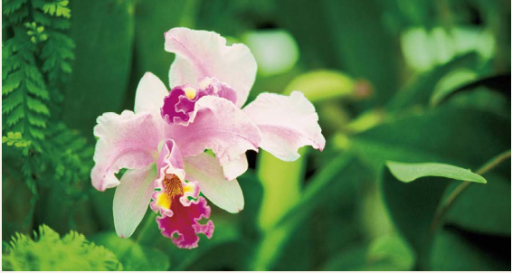
Breathe in beautiful native flora