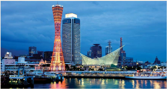
Marvel at modern architecture