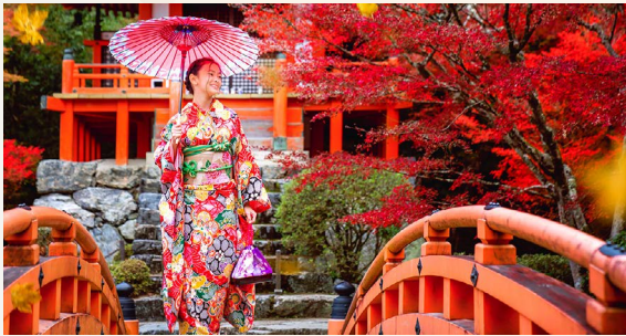
Autumn in Kyoto, Japan