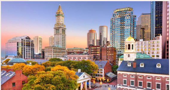
Explore historic Boston, Massachusetts

Discover northern wonders in Atlantic Canada, Greenland, Iceland and Northern Europe as you sail in the wake of the Vikings.