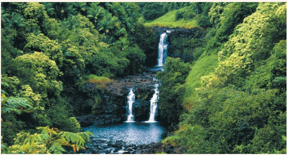
Unique and beautiful Umauma Falls