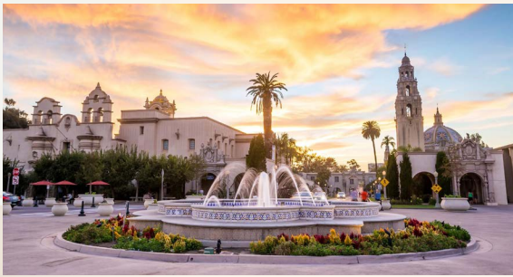
Balboa Park, San Diego

Cross both the International Date Line and the equator as you experience island cultures and enjoy overnights in four incredible ports.