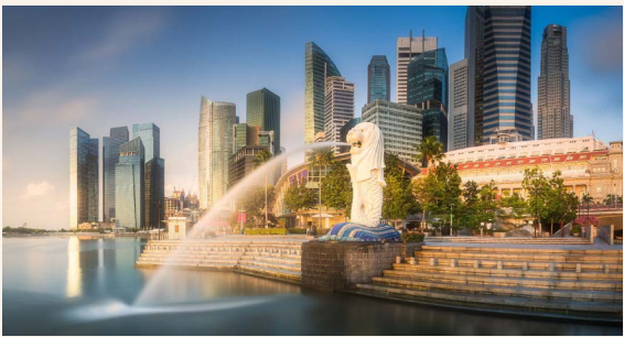
Magnificent Marina Bay, Singapore