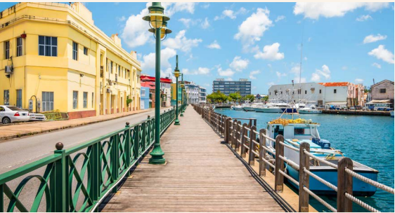
Explore historic Bridgetown, Barbados

This map reflects the 2025 sailing. *Opening Soon.