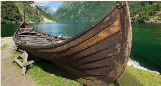
See perfectly preserved Viking artifacts