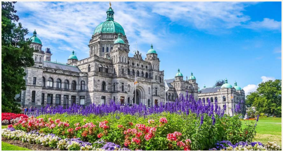
Charming Victoria, British Columbia