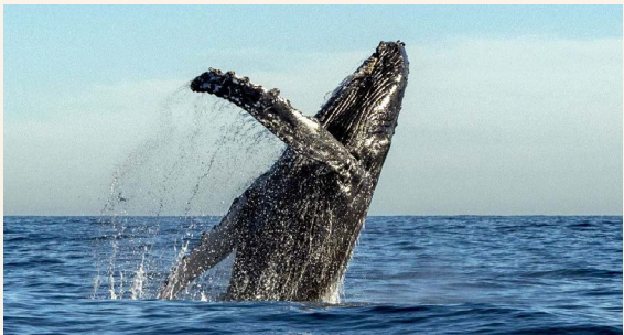
Witness marvelous marine mammals