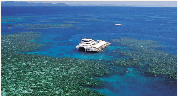
Sail Australia's Great Barrier Reef