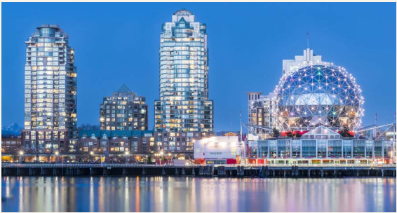
Vibrant Vancouver, British Columbia

VISIT HOLLANDAMERICA.COM OR CONTACT YOUR TRAVEL CONSULTANT TODAY.