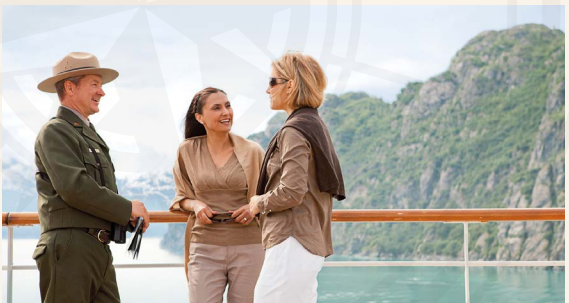
Onboard experts help you delve deeper