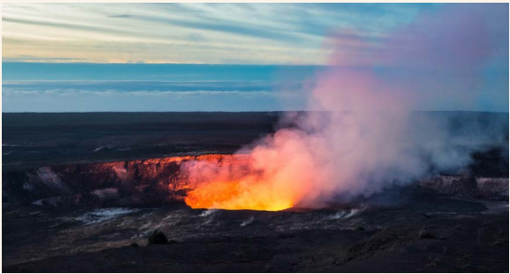
Kilauea Volcano, Hawaii