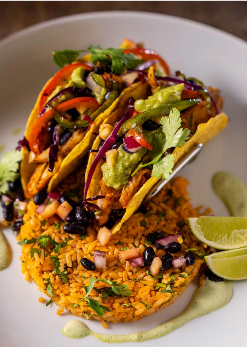
Port-to-table, locally inspired menus, wine selection and featured cocktails