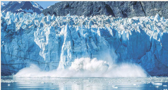
Glacier Bay National Park, Alaska

Spend the Summer Solstice at the Arctic Circle while cruising your way through Alaska's perennial favorites and hidden treasures.