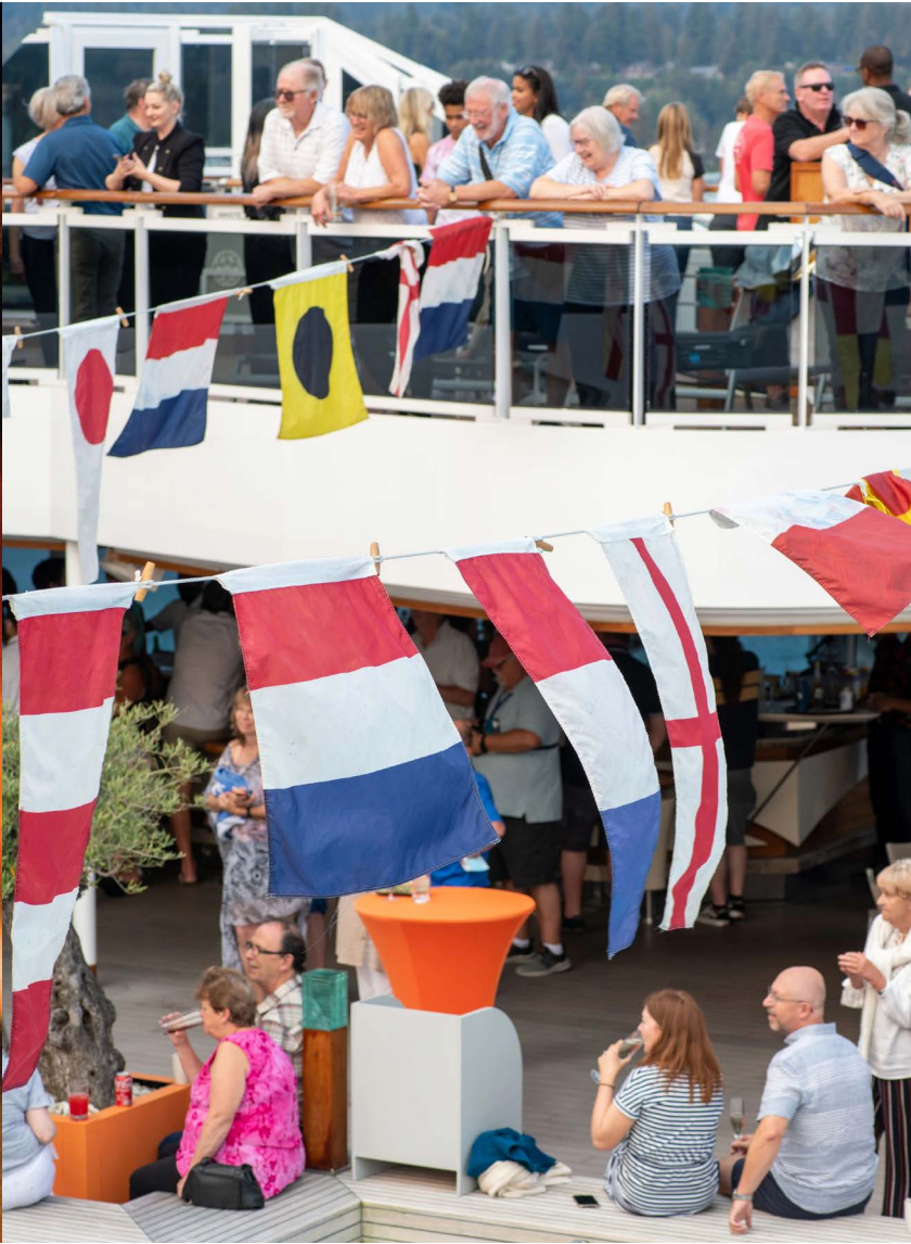
Greatest hits of our iconic parties, sailaways and classic cruise activities