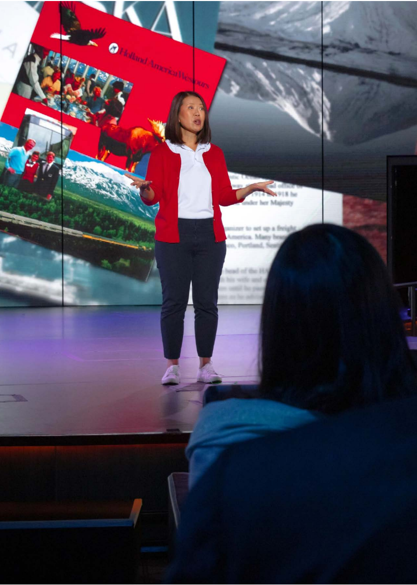
Diverse line-up of our World Stage entertainment