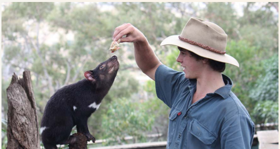
Meet Tasmania's famous devils

Encounter amazing wildlife, world-renowned wines and the jaw-dropping Great Barrier Reef as you circle Australia.