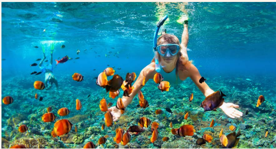
Get close to sea life