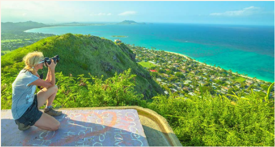
Survey tropical forests