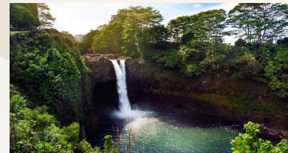
Rainbow Falls, Hilo, Hawaii

Call on nearly a dozen beautiful islands as you traverse hemispheres and continents on this transpacific journey of discovery.