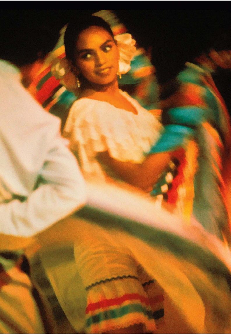
Onboard experts share insights into history and culture

In addition to our award-winning onboard programming, we have curated the “best of” Grand Voyages onboard programming to further enhance your Legendary Voyage experience.