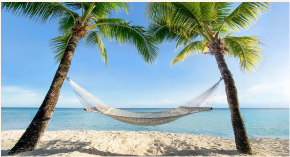
Wind down underneath palm trees