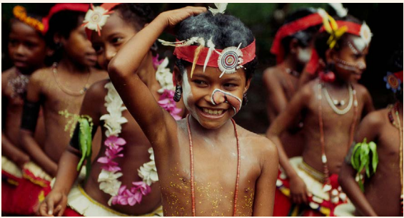
Make new friends in Papua New Guinea