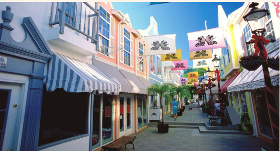
Visit Dutch-flavored St. Maarten