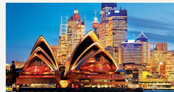
Sydney Opera House, Australia