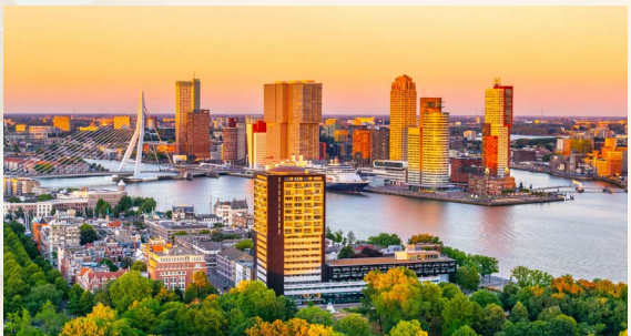
Visit our hometown of Rotterdam, the Netherlands