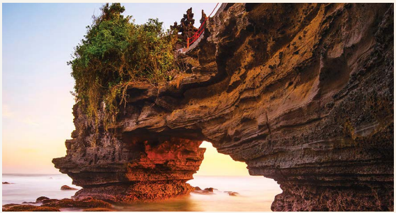
Batu Bolong sea temple, Bali, Indonesia

Collect a lifetime's worth of memories as you cruise through majestic straits, volcano-laced seas and stunning coral reefs.