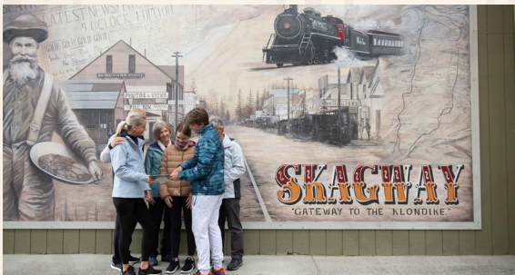
Experience frontier living in Skagway, Alaska