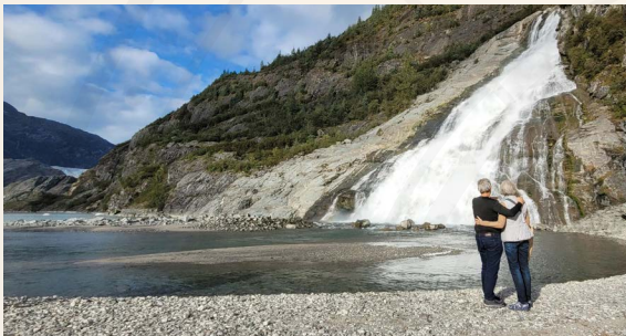
Nugget Falls, Tracy Arm Fjord, Alaska