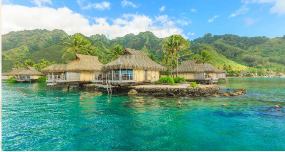
Overwater bungalows in Papeete, Tahiti