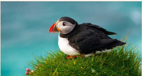
Admire colorful puffins at play