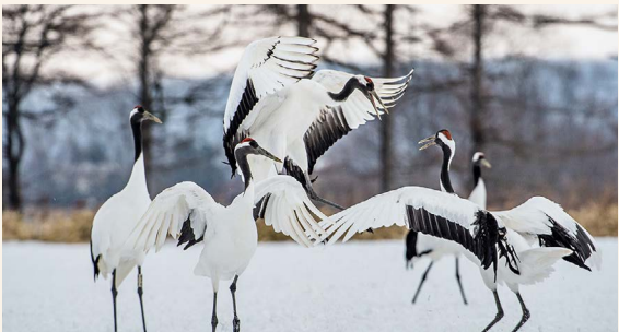
Graceful Japanese cranes