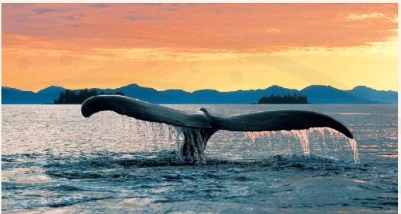
Keep watch for whales