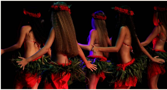
Experience local cultures