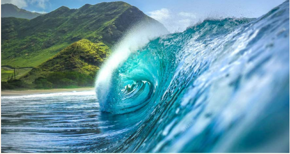
Soak in turquoise Tahitian seas