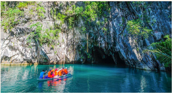
Puerto Princesa, Philippines