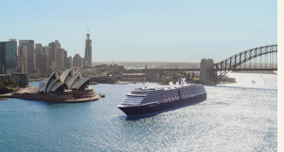
Sail spectacular Sydney Harbour