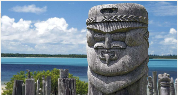
Ancient figure, New Caledonia