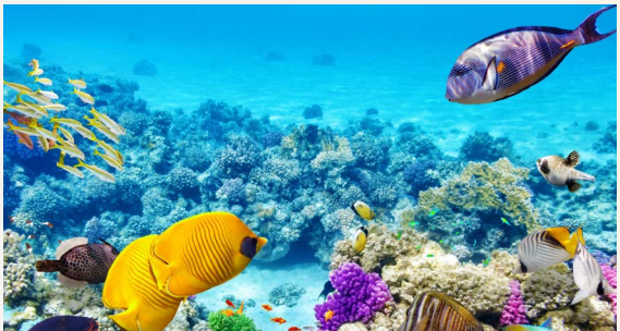
See the brilliant Great Barrier Reef