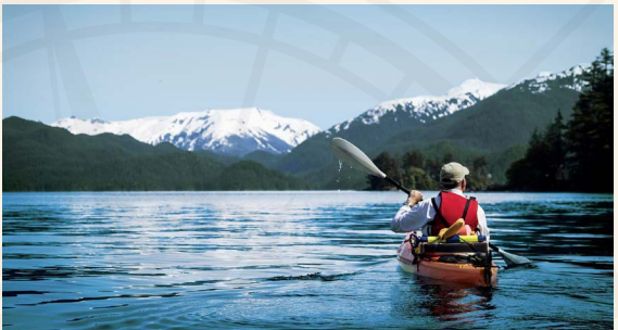
Kayak through pristine waterways