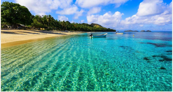
Refreshing turquoise water

Stroll pristine white- and black-sand beaches, swim with sea turtles, and marvel at kaleidoscopic coral reefs as you cross the Pacific Ocean.