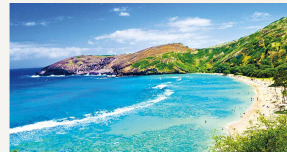
Stroll Honolulu's famous beaches