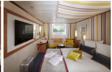
Picture Window Cabin A-ROSA DONNA, A-Grade