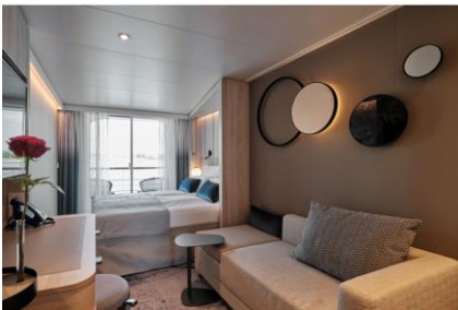
Standard Balcony Cabin A-ROSA SENA, C/D-Grade

Majority of cabins have a 2-berth configuration with a combination of porthole and picture window cabins (lower deck) and generally Juliette-Balcony cabins on deck 2 and above. Triples and quads are also available on some ships. A-ROSA's newest ship, SENA even boasts five-berth family cabins and all SENA's standard cabins are equipped with balconies that provide comfortable seating for two guests.