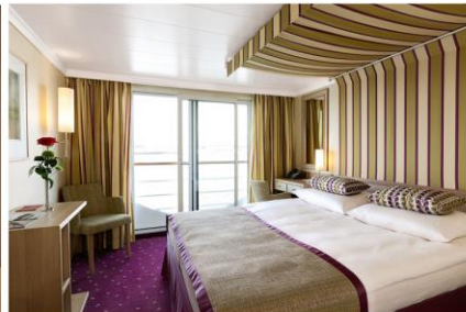
Juliette Balcony Cabin A-ROSA SILVA, C/D-Grade