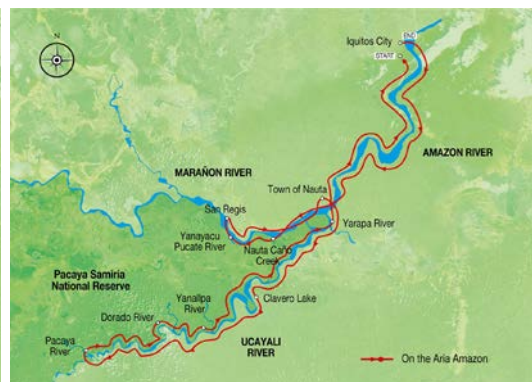
7-Night Itinerary - High Water Season