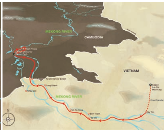
4-Night Upriver - High Water Season