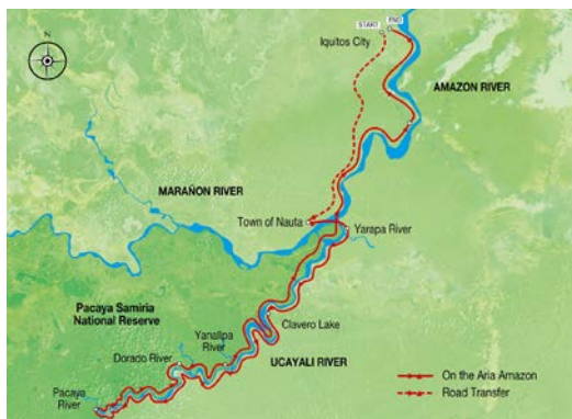
4-Night Itinerary - High Water Season