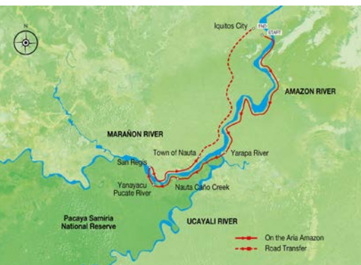
3-Night Itinerary - High Water Season