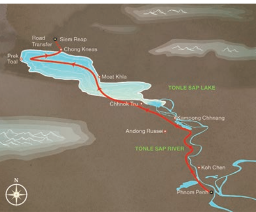
3-Night Upriver - High Water Season